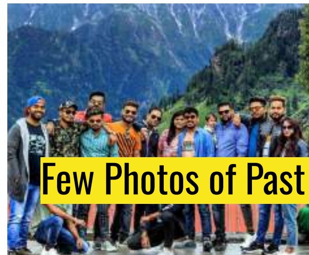
Few Photos of Past Tours