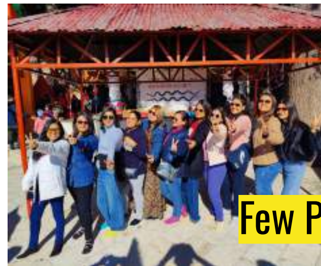
Few Photos of Past Tours of Kashmir